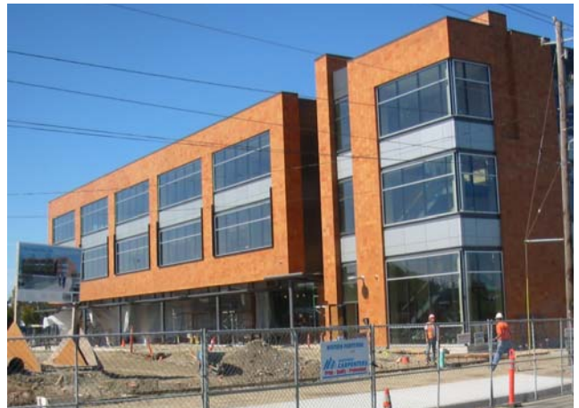
Near Completion: Oregon Clinic Gateway Building, September 2006

We are extremely delighted to announce the move into our new home at 1111 NE 99th Avenue at the Gateway Transit Center. This beautiful facility consists of 100,000 square feet and three floors of clinical space to house modern offices and space for many of the divisions of The Oregon Clinic and affiliated services. Our excitement comes from our improved ability to offer our patients the best specialty care anywhere, consistent with our tag line – Specialty Medicine with Commitment, Care and Compassion .